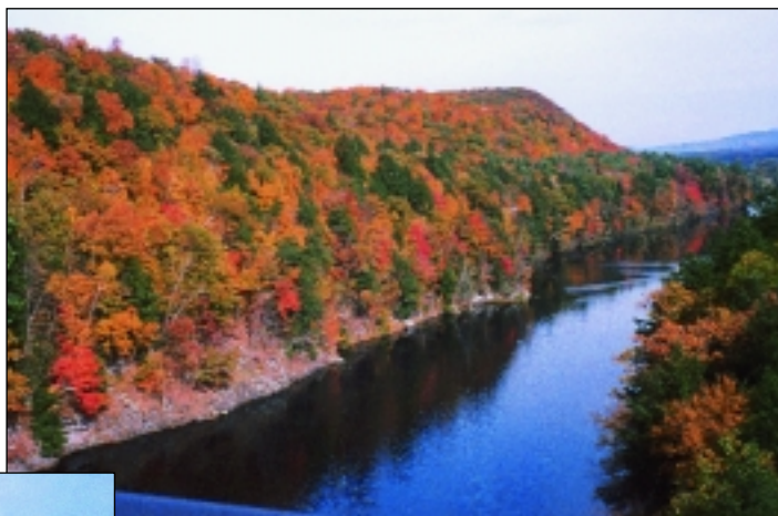
Above: New England in the Fall Left: Capitol Building, Montpelier

Throughout our visit, the fuss made of us by the Americans was overwhelming: "Thank you for coming"... "thank you for standing with us"... "let me buy you a drink" and so on.