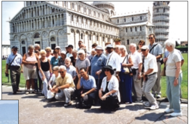
Above: Photocall near the Leaning Tower of Pisa Left: Florence viewed from Monte alle Croci

Our first day took us to Terme Di Montecatini Spa followed by a trip up to Montecatini Alto on the funicular railway for lunch amongst some of the most beautiful surroundings in that area. On our second day we met our Tour Guide, Massimo and warmed to him very quickly. He took us to Lucca –