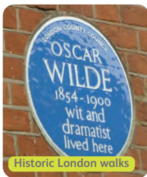
Historic London walks