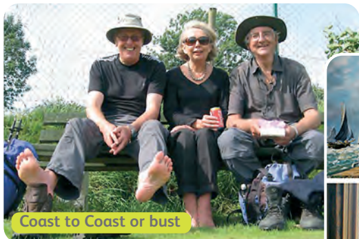
Coast to Coast or bust

With each edition of XPA News, we aim to bring you a whole range of stories and information. But there's so much more for you to enjoy on the XPA section of the Xerox Pensions website – www.xeroxpensions.co.uk/fss-xp-xpa.asp . Here are some examples.