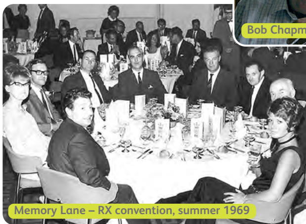
Memory Lane – RX convention, summer 1969

Don't forget, there are new stories every month on the website.