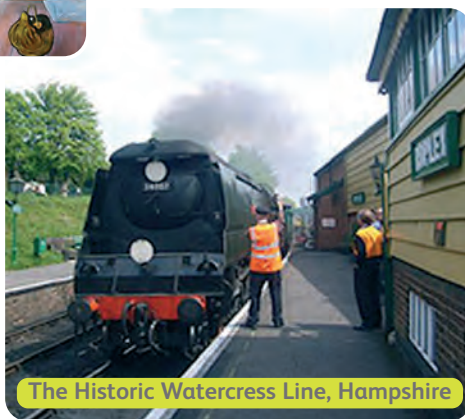
The Historic Watercress Line, Hampshire