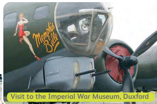
Visit to the Imperial War Museum, Duxford