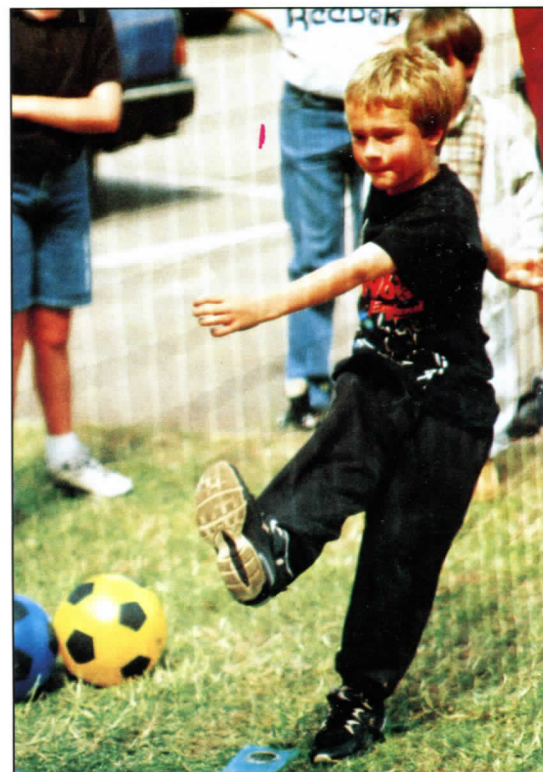
■ A goal in one!

Planning for the 40th Anniversary Open Day was started six months ago by a committee of dedicated organisers, and over 120 volunteers started work in earnest on the previous Thursday to prepare for the avalanche on Saturday 15th July. Just imagine the organisation behind a set of events as varied as a barbecue for over 4,000 people, a Document Technology Centre tour, a vintage vehicle show, Punch & Judy, Hook-a-Duck, and computerised magic carpet rides, not to mention running production lines on Saturday afternoon, producing colouring books and a myriad of activities to ensure that everyone visited the site safely and were fed,