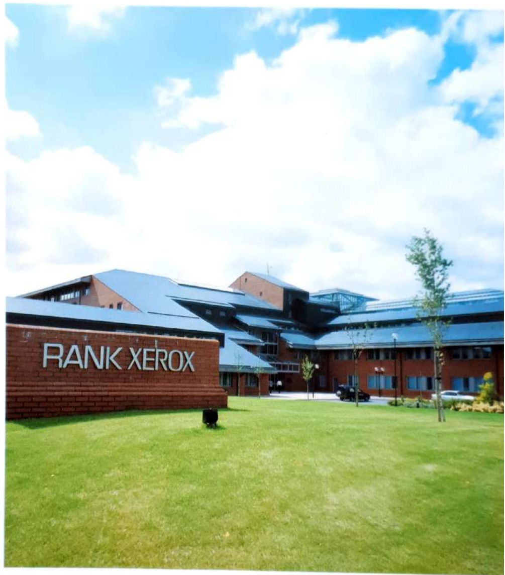
International Headquarters, Marlow